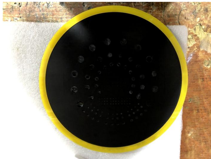
Figure A.2 TO J3 schematic diagram